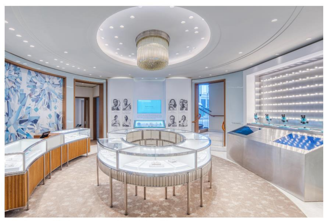
Find the 'Diamonds of Tiffany' immersive journey at their store in Suria KLCC

Have you ever wondered how Tiffany's exquisite diamond jewellery pieces come into being? Find out at the immersive Diamonds of Tiffany experience at their Suria KLCC boutique.