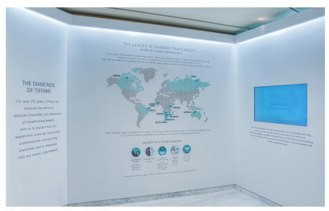
Tiffany & Co. are leaders in diamond traceability

Tiffany & Co. is committed to responsible sourcing and how it is an industry leader in diamond traceability. You can find out the full craftsmanship journey of each individually-registered Tiffany diamond, including the region and country of origin.