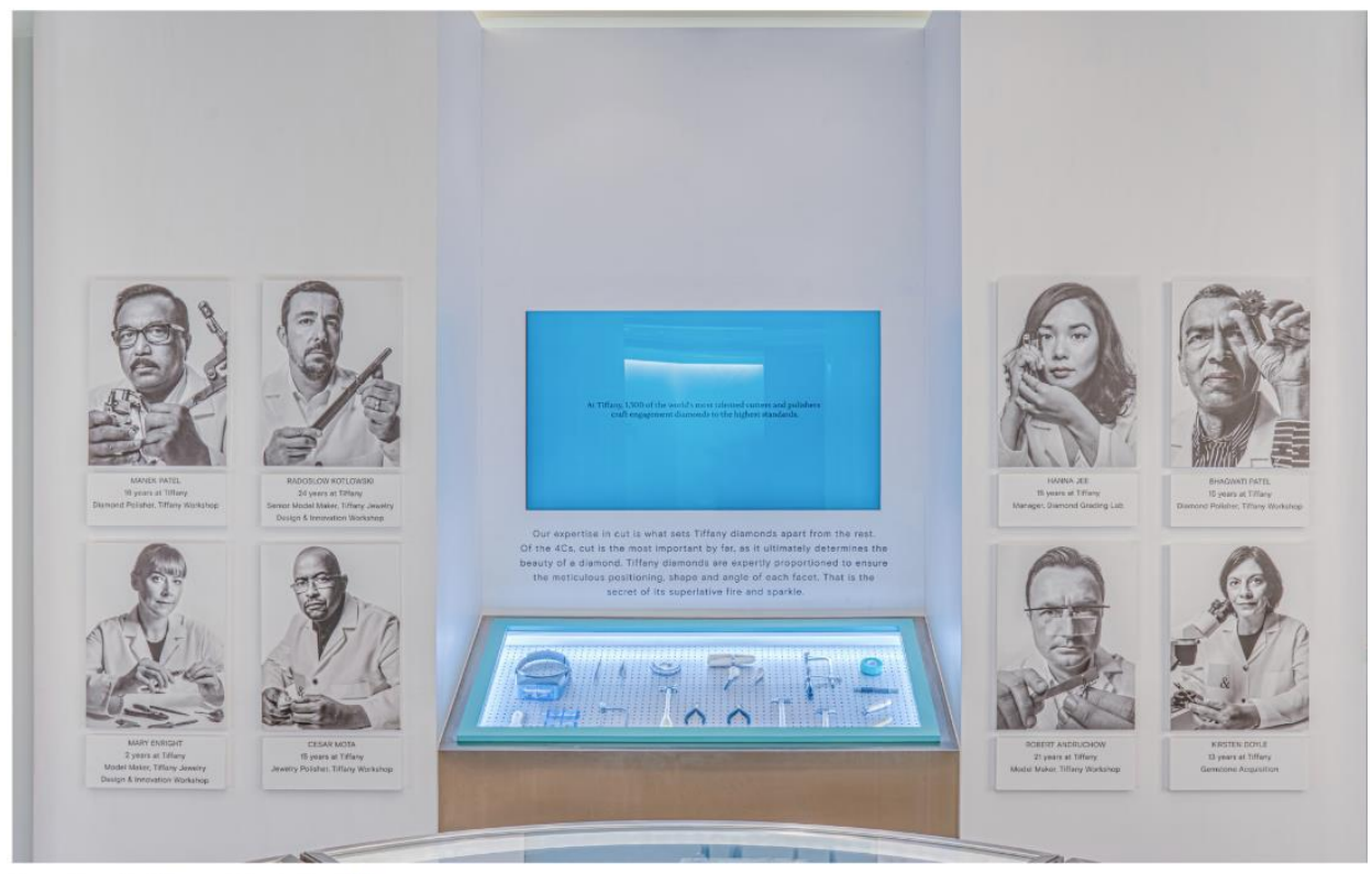
A recreation of the Tiffany workshop in New York

In this recreation of the Tiffany Workshop in New York City, guests can meet the team of highly-trained craftspeople—from the diamond polishers to the model makers—and the tools they use to meticulously cut each stone to achieve maximum beauty and brilliance. It is a captivating exploration of the American jewellery house's unrivalled artisanal legacy.